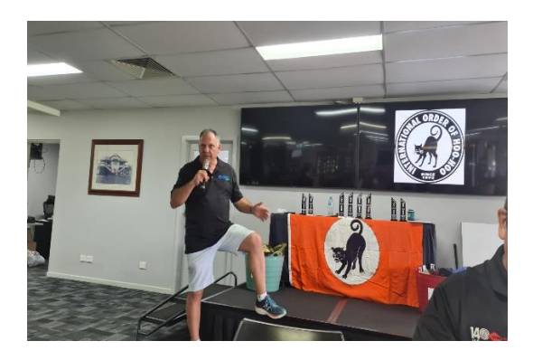
Hoo-Hoo on display

One of the sponsors on the holes – we raise $3600 by selling off 18 hole sponsorships @ $200 per hole